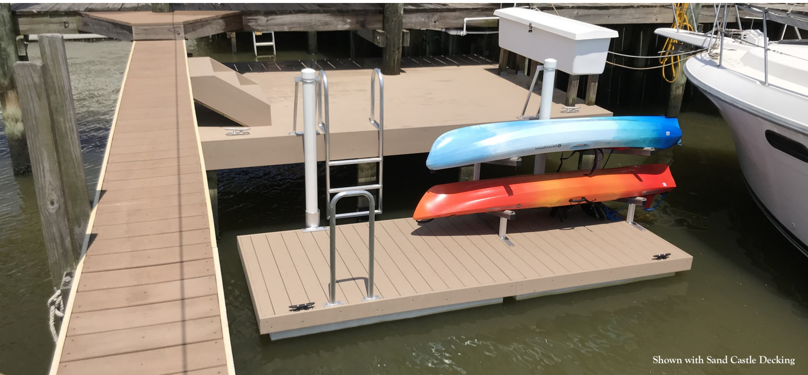
Shown with Sand Castle Decking

Our unique manufacturing process enables us to create a low profile 5'x14' floating dock for paddleboarders that has a freeboard as low as 6" from the water. This provides a safe, stable and almost water level surface to launch your SUP from. The waist high railing provides even more stability as you get on and off of your Paddleboard.